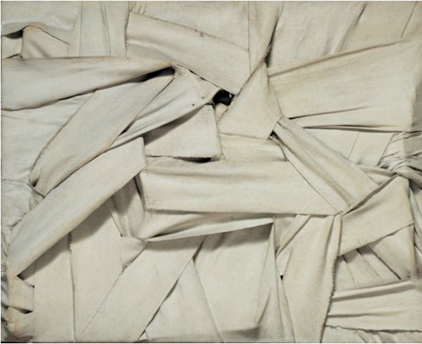
Salvatore Scarpitta, Sans titre , 1958, Bandes et technique mixte, 66 x 81 cm