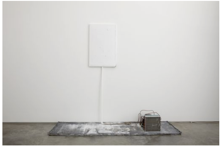
Pier Paolo Calzolari, Omaggio a Fontana , 1987 Cuivre, plomb, fer et moteur, 213 x 200 cm

The young generation that followed in their footsteps: Gianni Colombo, Dadamaino, Vincenzo Agnetti, Turi Simeti, Nanda Vigo . Then, the artists of Arte Povera have made it a significant subject of research: Alighiero Boetti, Pier Paolo Calzolari, Pino Pascali, Jannis Kounellis, Mario Ceroli .