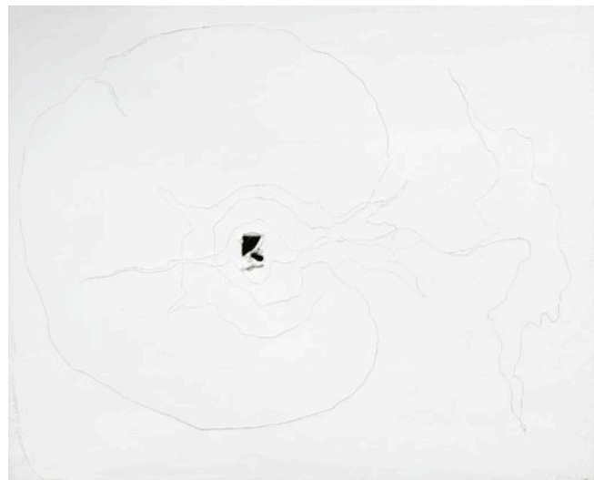
Lucio Fontana Concetto spaziale , 1962 81 x 100 cm, huile, trou et graffiti sur toile

According to Lucio Fontana, white represents the immaculate immensity of the experimental spaces yet to be conquered – the “tabula rasa” – but also the powerful synthesis that the color symbolizes. Fontana’s Ambienti spaziali were the ultimate playground for artistic experiments , where he materialized his investigations on light, opening the way to the idea of total art, which unites painting, sculpture, architecture and design, and united the young generation of artists who took the center stage in the mid-1950’s, in search of an artistic, spiritual and intellectual adventure.