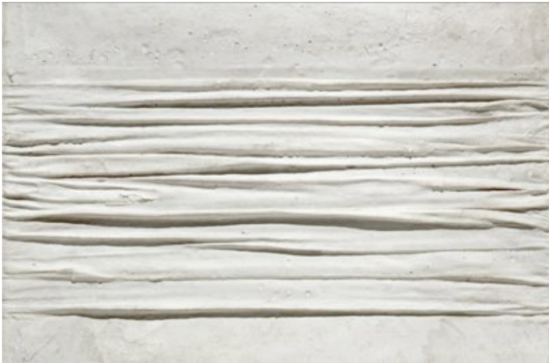
Piero Manzoni, Achrome , 1958-59, 30x40 cm, Kaolin on canvas

Lucio Fontana was one of the first artists to experiment white monochrome idea before this research theme became emblematic for the artists of the AZIMUTH group and later for those that were part of the ARTE POVERA movement.